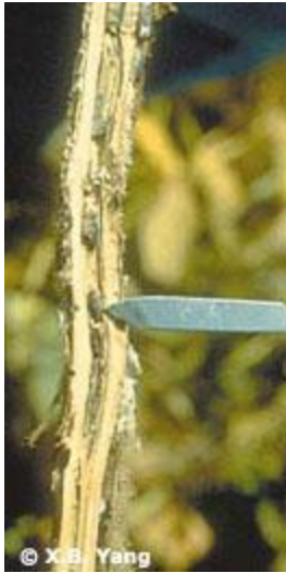
Figure 3. Sclerotia in a soybean stem. This structure, which looks like mouse droppings, is formed on and in soybean stems.

Sclerotia fall to the soil surface during harvesting, and germinate in the spring to form apothecia. Sclerotia can also be present in harvested beans.