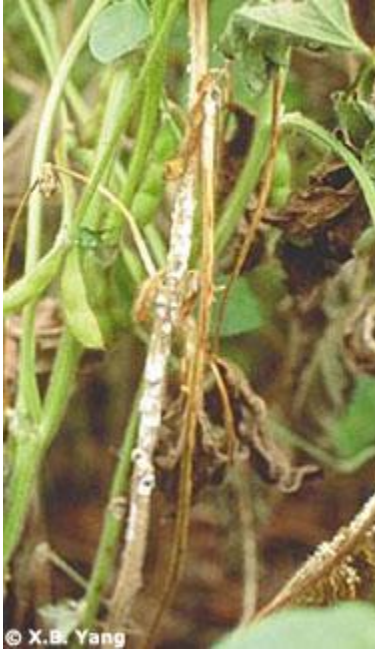
Figure 1. White mycelium on stem and pods is a sign of white mold infection.