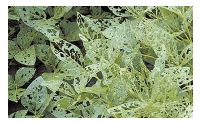
Fig. 2. Economically damaging levels of green cloverworm were last seen in lowa forty years ago.

The larvae appear pale green with one or two white stripes along their sides. Their three pairs of abdominal prolegs distinguish them from other similar caterpillars. For example, armyworms and cutworms have four pairs of prologs; loopers only have two pairs of prolegs. Green cloverworm adults are black and gray moths with a obvious snout-like mouth, and can be distinguished from other moths using a <u>chart</u> published in the June 2001 ICM News.