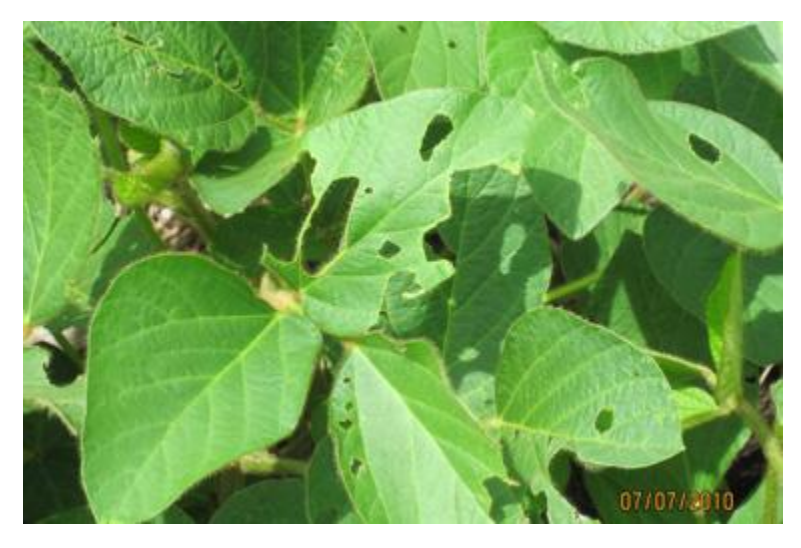
Fig. 1.Sub-economic defoliation caused by green cloverworm

Iowa State University researchers are seeing green cloverworm defoliating soybean in central Iowa (Fig. 1). The caterpillars are a rare pest of soybean in Iowa, but researchers have reported higher than normal populations this year. These moths migrate into Iowa from southern states each year. The last major outbreaks occurred in the 1970s (Fig. 2).