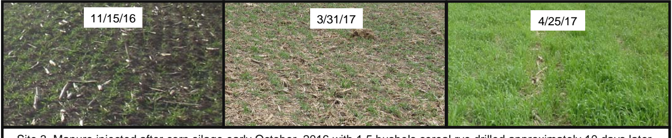
Site 3. Manure injected after corn silage early October, 2016 with 1.5 bushels cereal rye drilled approximately 10 days later.

was drilled in approximately 10 days later. The higher seeding rate and drilled establishment method resulted in an even stand with the highest biomass and highest stand count of the sampled sites. For people wanting to try cover crops, silage acres are a great place to start. The cover crop can get established earlier and have more fall growth, which provides greater erosion protection.