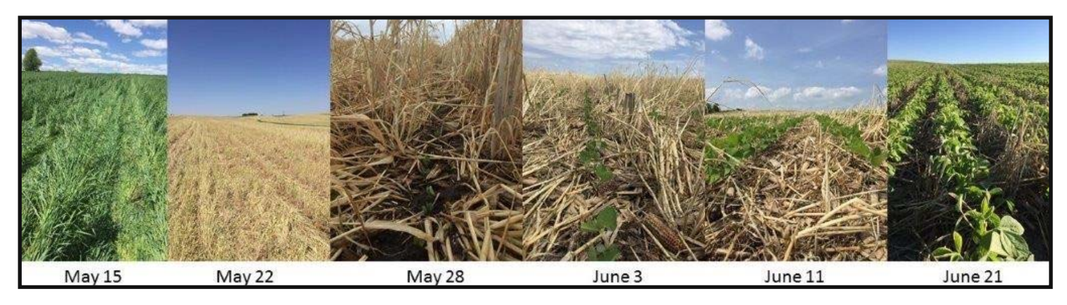
Photos taken in 2016 in Allamakee County by Neil Sass, NRCS Area Agronomist

Once again, it depends. What crop will you be planting next? Nitrogen management tends to be the biggest consideration ahead of corn. It is suggested to apply 20-50 lbs N at planting to counteract nutrient tie-up. Some research has also indicated that cover crops can act as a "green bridge" for pests, but that terminating 10-14 days before corn planting can reduce this risk. The allelopathic impact of rye on corn or soybeans is thought to be minimal. You can "plant green" into a cover crop with soybeans as long as you terminate within 5 days of planting per crop insurance regulations (see photos below). One of the biggest issues regarding planting into a cover crop can be managing the residue. Row cleaners can be very important for keeping the planting strip clean and you should verify that you are getting a consistent planting depth. The longer the cover crop grows in the spring, the greater the benefits including reduced erosion, weed suppression, and soil moisture management.